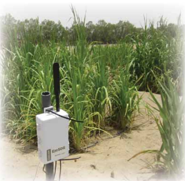
Developing optimum irrigation management and monitoring systems

Water management deals with developing new irrigation systems to optimally use irrigation water for better crop production and environmental protection. A critical aspect of water management is the formulation of policy instruments.