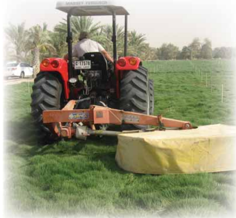
Development of non-conventional crop production systems

In the crop diversification and selection program we are focusing on the development of conventional and non-conventional production systems including vegetables, forages, halophytes, agroforestry and biofuels systems, suitable for marginal and saline environments.