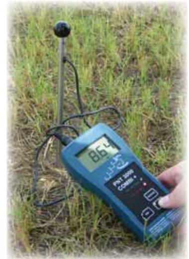
Soil salinity measurement and monitoring are pre-requisite for soil management

In the soil management program we are focusing on enhancing the soil health to guarantee productive soils for agriculture production. This is achieved through improving water and nutrient use efficiencies and salinity management.